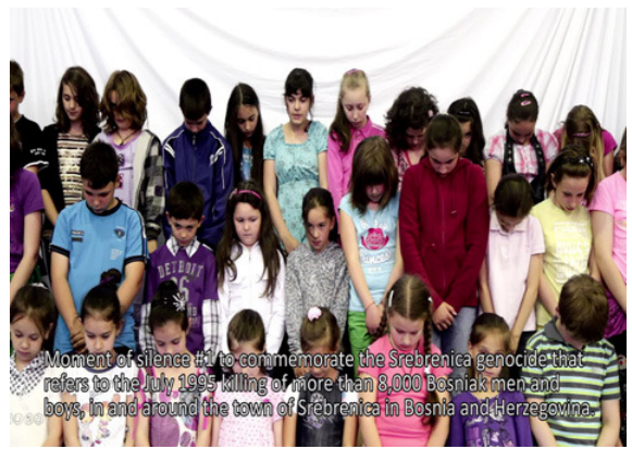
Alex Mirutziu, Pending work#3 (Moments of silence), HD video, sound, 15:38min, 2011

"Pending Works operate within a nexus of processes, interactions and mediations that are clearly distinguishable as non-linear, noncumulative and task-based, with the focus not on what is happening but on when it is happening. What is expressed neither describes nor represents existing matrixes of recognition but rather reformulates possibilities. Images, language and signs are critical engagements with reality and not merely its representation. My attention is devoted to work that is not primarily a productive, result-oriented process. This work may be seen as a complex time frame of the art project, as pure activity that occurs in time. This new practice induces you to look beyond; is there a real there - at all? It reaches beyond the specific realization of an idea towards an expanded cultural and social field. I believe that this particularity is a call for thought, beginning with the artist who applies a task-based principle of announcing the time frame of each work for the different ways it may be observed. This then gives rise to questions on: internal duration of the idea versus external duration of the work; sufficiency of time and its relevancy; how much